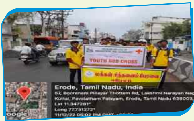
In connection with 141st Birth Anniversary of Mahakavi Subramaniya Bharathiyar, a rally at Karungalpalayam, Erode, where he delivered his last speech.