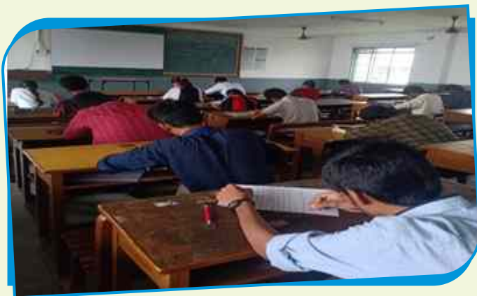
Tamil poem writing competition conducted by Fine Arts Club