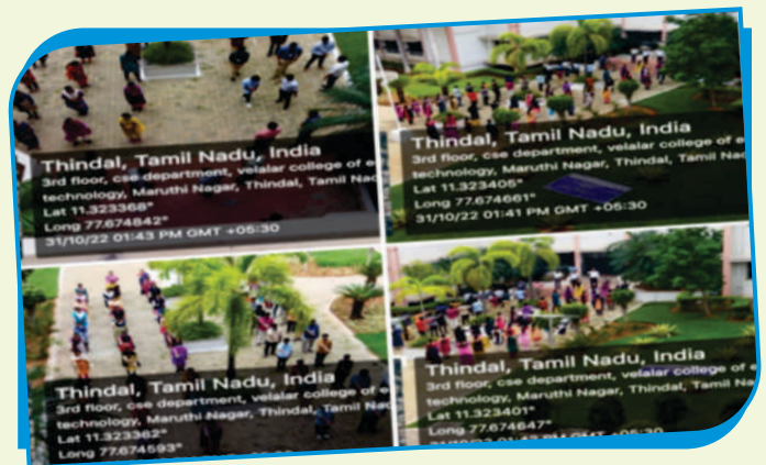
Students taking pledge on National Unity Day which was observed to celebrate the birth anniversary of the Iron Man of India Sri Sardar Vallabhbhai Jhaverbhai Patel

VELALAR COLLEGE OF ENGINEERING AND TECHNOLOGY