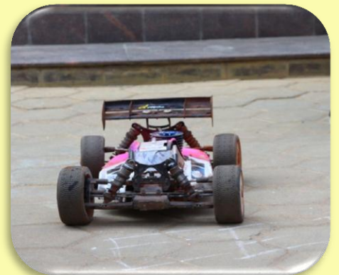
Snapshots of models created by our students during our Symposium- Mech Zeal '19