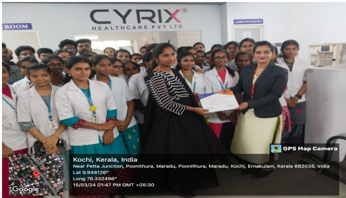
Cyrix healthcare Pvt Ltd,Poonithura, Kerala

Cyrix Healthcare Pvt Ltd has made a name for itself in the list of top suppliers for Ultrasound machines and radiological equipment in Kerala. This company is located at Poonithura, Kerala. In addition to manufacturing Ultrasound machines, Cyrix Healthcare Pvt Ltd also provide services and internships for biomedical students.